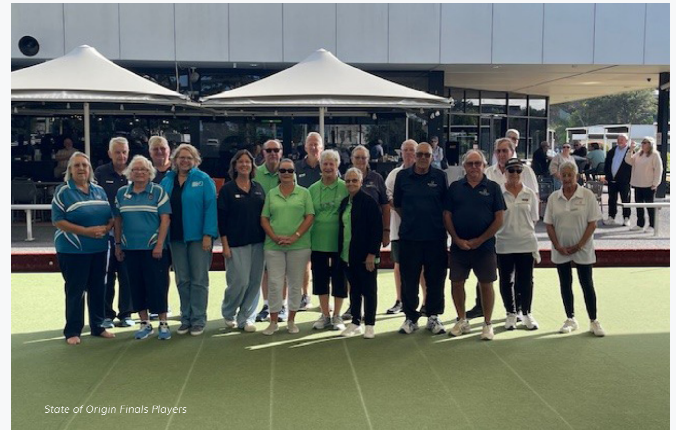
State of Origin Finals Players