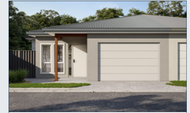
Fig Tree | $630,000