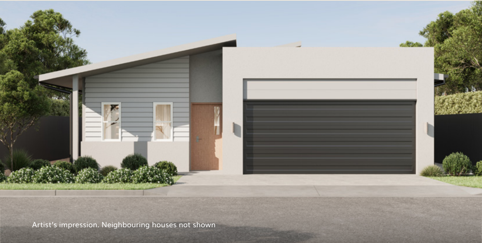
Artist's impression. Neighbouring houses not shown