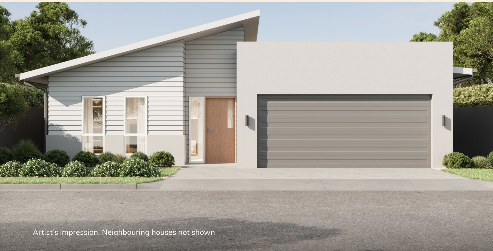
Artist's impression. Neighbouring houses not shown