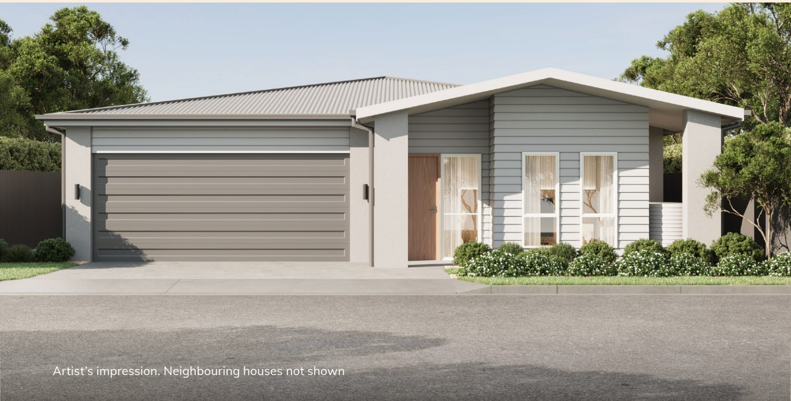
Artist's impression. Neighbouring houses not shown