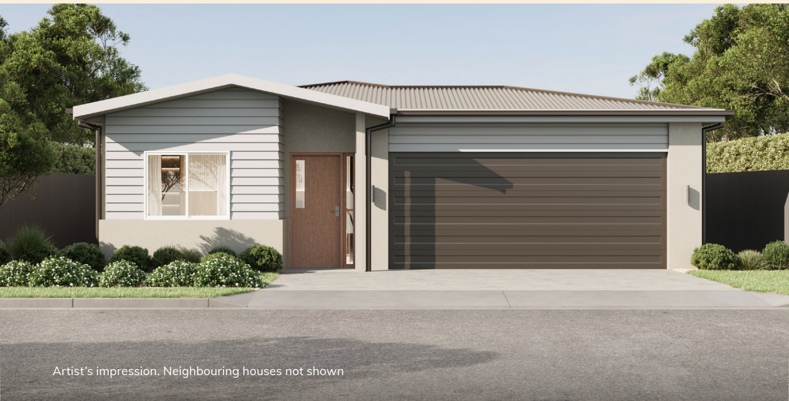
Artist's impression. Neighbouring houses not shown