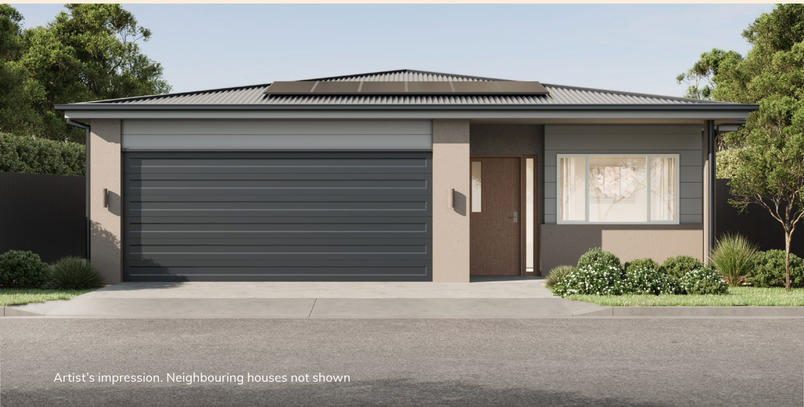
Artist's impression. Neighbouring houses not shown