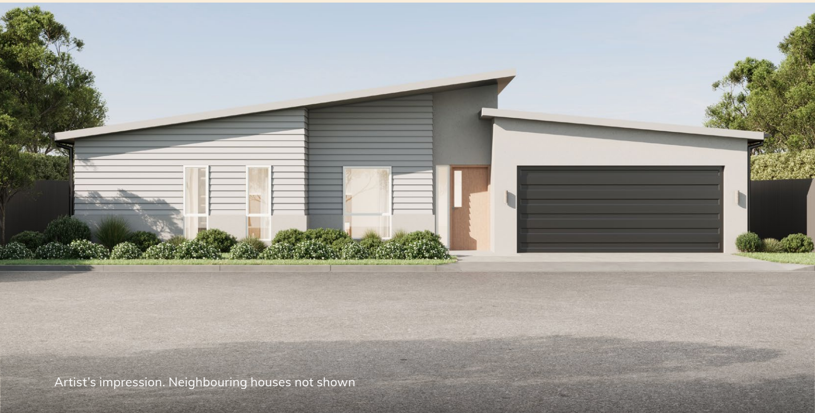
Artist's impression. Neighbouring houses not shown