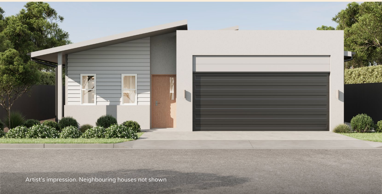
Artist's impression. Neighbouring houses not shown