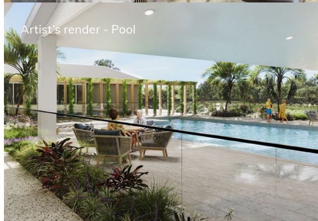
Artist's render - Pool