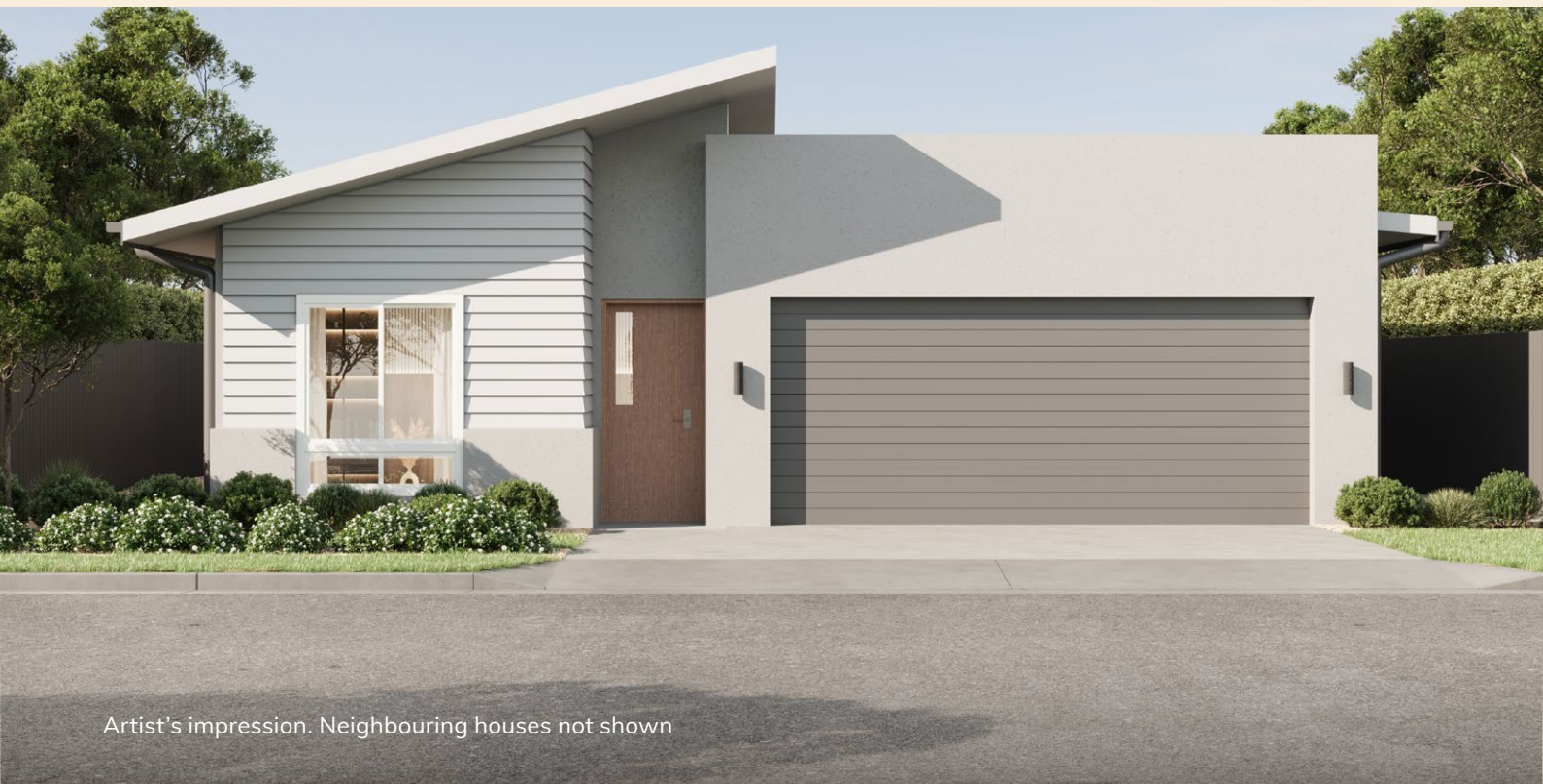
Artist's impression. Neighbouring houses not shown